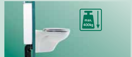
High loading capacity