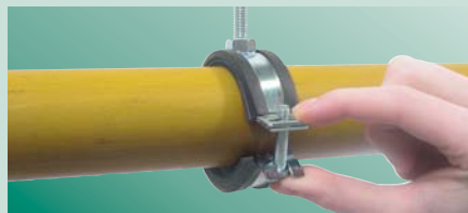
Close clamp / push screw