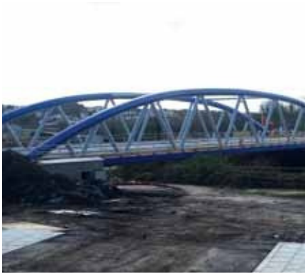
Bristol - UK / Bridge Construction