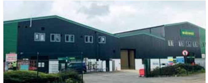
Walraven Ltd. | 18 Wildmere Road, Banbury (GB), Oxon, OX16 3JU Tel. +44 1295 75 34 00 | sales.uk@walraven.com

In the UK we have production, warehouse and sales facilities in Banbury, Oxfordshire, and a network of stockists and distributors across the UK and Ireland.