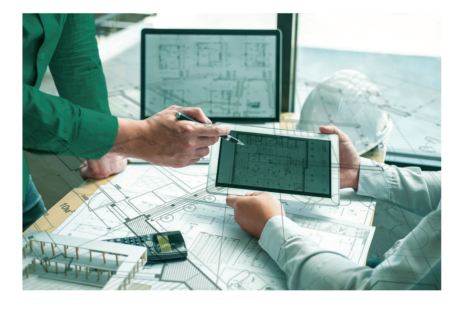
Pre-and onsite project support